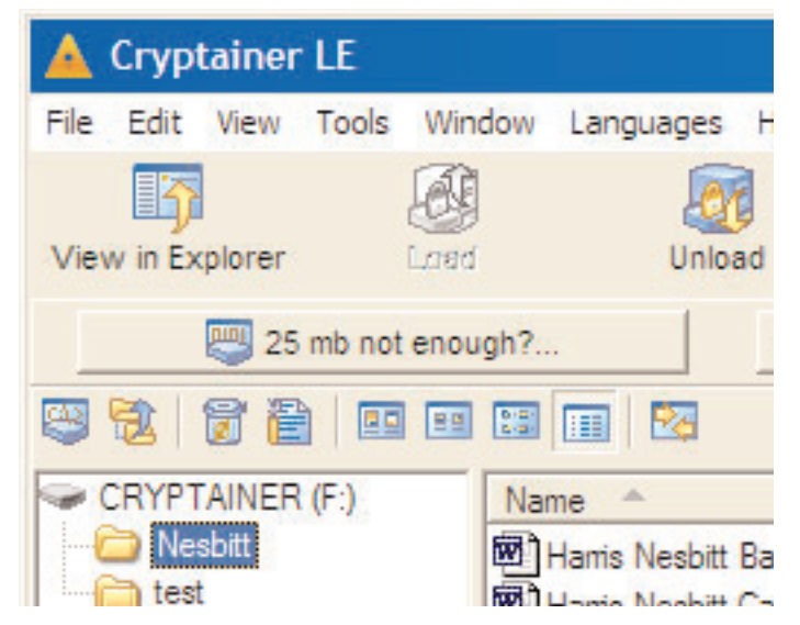
Protect your data from prying eyes with the free Cryptainer LE.

can find is ZoneAlarm from Zone Labs. If you're only looking for a twoway firewall, there's no need to buy one of ZoneAlarm's for-pay versions, which offer extra features such as virus protection.