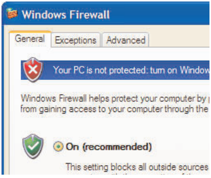
At the very least, make sure to turn on Windows XP's firewall.