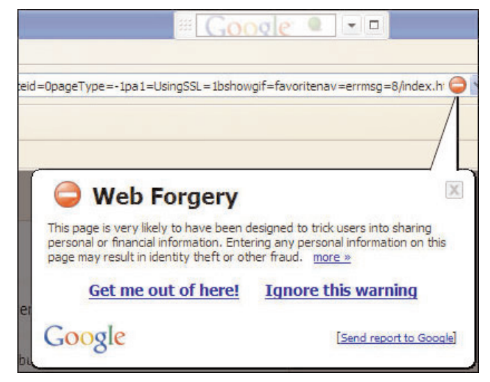
Don't go there! The Google Toolbar includes an anti-phishing feature to protect you from phishing scams.

One of your biggest security dangers is sitting in plain sight, and you probably don't even know it. If you've set up your PC to share files and folders, it's exceptionally easy for people to look through all your files, grab personal information, and even delete files and folders as well. Odds