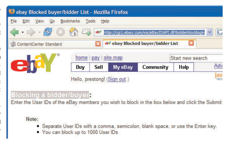
Block suspected scammers from bidding on your items.

Ship the item, and you've been scammed. The PayPal notification was in fact a forgery, and, of course, if you first ship it before getting payment, you'll never get paid.