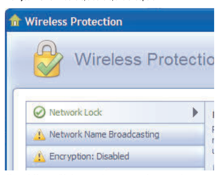
Network Magic will help you configure your wireless router for maximum security.